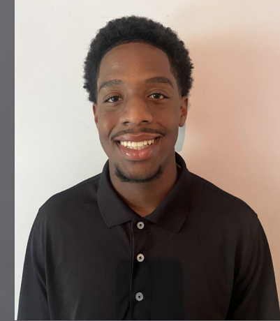
Robert Kennedy Delaware State University Aviation