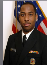
Nathan L. Anderson Memorial Scholarship Foundation, Inc